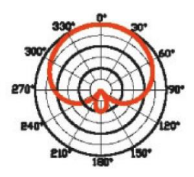
Figure 1: Polarpattern